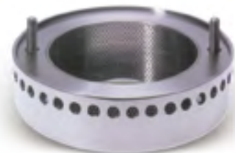
Standard emulsor head and emulsor screen