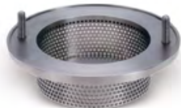
Square hole high shear screen™