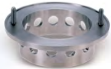
General purpose disintegrating head

The machines are in most cases self-cleaning, a short run between successive operations in water, detergent or an appropriate solvent being all that is necessary. For more thorough cleaning, dismantling is easy and downtime minimal.