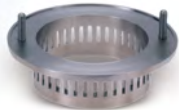
Slotted disintegrating head